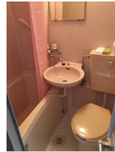
※画像はイメージです。/The image is for illustration purposes only.

T&Y日本語学校は、留学生のための寮を完備しています。料金は毎月20,000円(二人部屋)~50,000円(一人部屋)選択ができます。生活に必要な家具や電気製品はすべて備えてありますので、安心して快適な留学生活を送ることができます。 T&Y Japanese Language School has a dormitory for international students. The monthly fee is 20,000 yen (double room) or 50,000 yen (single room). The dormitory for international students is equipped with all the furniture and appliances necessary for daily life, so you can live safely and comfortably.